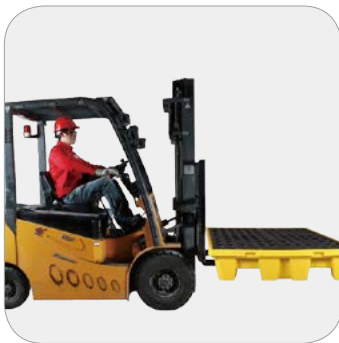
2-drum and 4-drum spill pallets have forklift slots for convenient forklift operation to improve efficiency (*forklift overload prohibited)