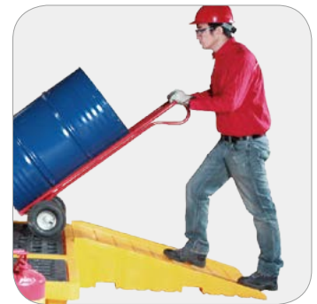
Poly spill pallet ramps make it easier to move large articles