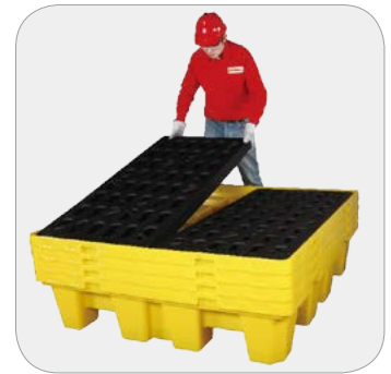
2-drum and 4-drum spill pallets with stackable structure save space and transportation costs