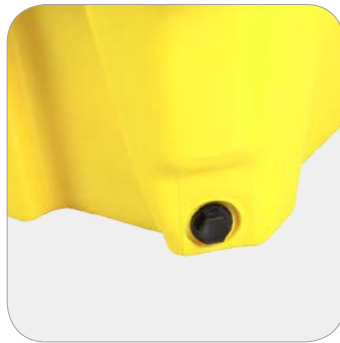
Hexagonal drain plug facilitates drainage