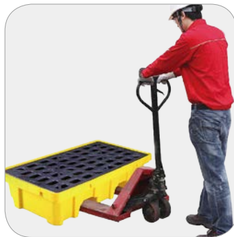
Hydraulic carrying vehicles can also be used to move pallets, which is more convenient