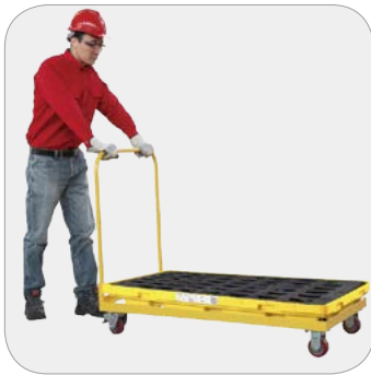
2-drum spill pallets with stackable structure save space and transportation costs